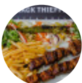
PLATE OF LAMB CHOPS